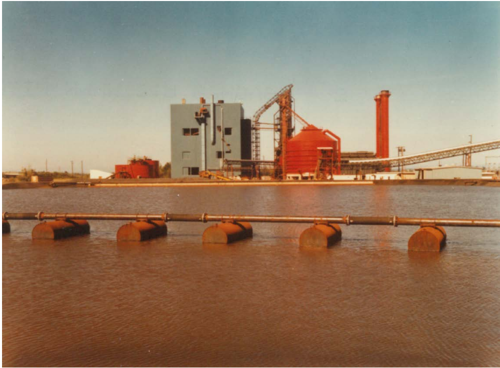
1969: The first MIDREX Plant at the former Oregon Steel Mills in Portland, Oregon, USA