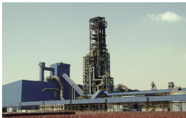
Figure 1 - Hadeed E MIDREX Module

In addition to the hot discharge feature, there must be an option for discharging cold product for times when the meltshop is down. This can be cold DRI (CDRI) or HBI. The HBI option also provides the plant the ability to sell merchant HBI if it cannot use all the DRI produced. Figure 2 shows Qatar Steel Module II, that also started up in 2007 and has the hot briquetting option.