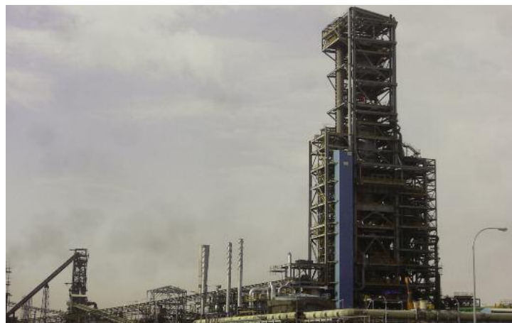
Figure 2 - Qatar Steel II MIDREX Module