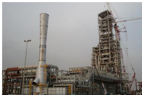
Tuwairqi Steel Mills