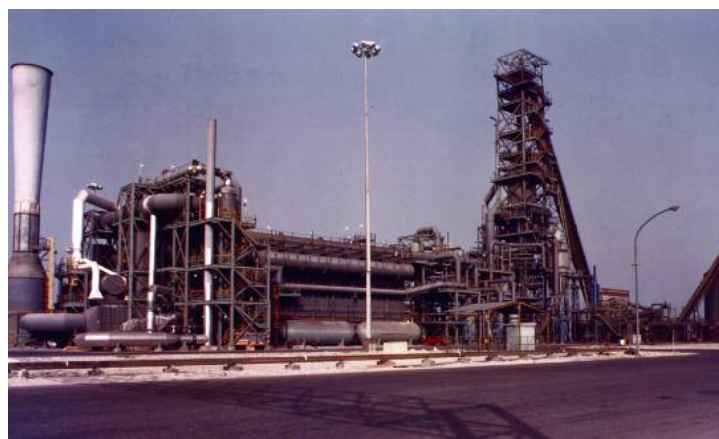
Qatar Steel Module 1