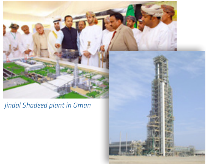
Jindal Shadeed plant in Oman

JSPL has plans to expand Jindal Shadeed over the next few years. JSPL is pressing ahead with the next phase of expansion with goals of producing 2 MTPA of finished steel in the second stage and in the third phase, 4-5 MTPA of steel in the next 4-5 years time.