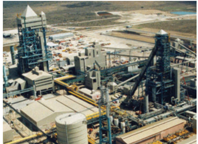
ArcelorMittal South Africa (Saldanha Works)