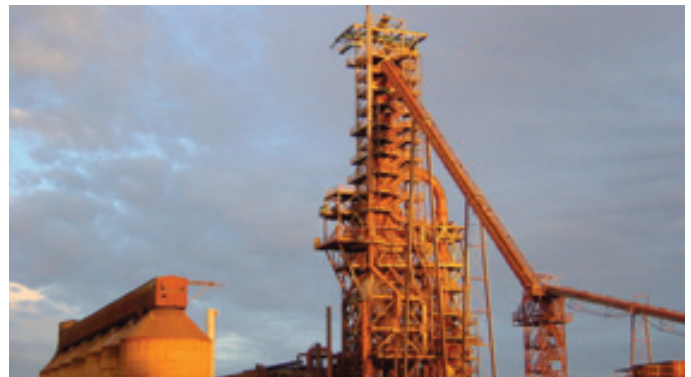
Antara Steel Mills