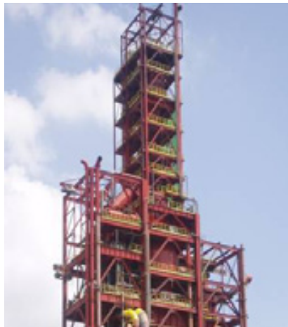
Essar Steel Module V

Twenty years after the startup of their first two MIDREX Modules, Essar started up during the month of November their sixth MIDREX Module, designed to produce cold DRI. In 2010, Essar Steel's five Hot Discharge Modules produced 4 million