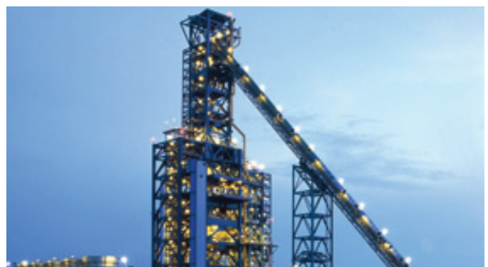
ArcelorMittal Lazaro Cardenas