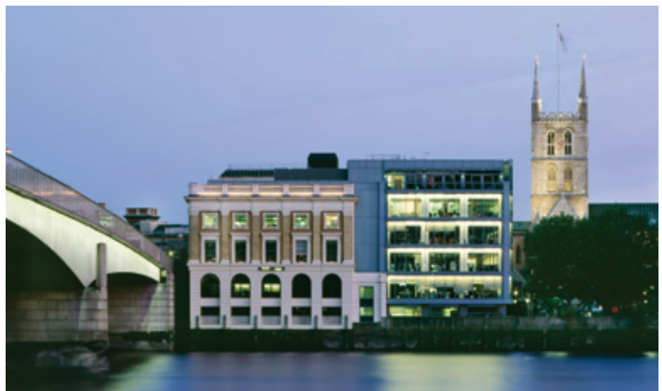
Midrex UK, Ltd. located in the heart of London, England at 2 London Bridge.

At first glance, the logic of a high technology process engineering steel sector company setting up office in Central London